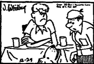
"If you knew how this tasted, you wouldn't beg."